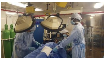
Sick Bay: the hospital/doctor’s office/dentist area on the ship.