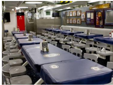
Mess Decks: a “cafeteria” area of the ship. This is where sailors eat their meals.