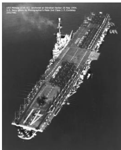
Ship: A large vessel that carries supplies and/or people.