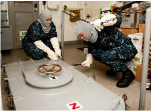
Hatch: a door in the floor.